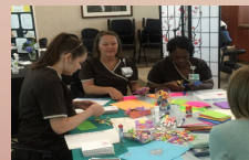
Caring for the Caregiver Event