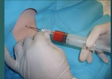
Figure 1. Epidural Blood Patch, McDonald, K. (2016) Retrieved June 8, 2020 from https://coreem.net/core/post-dural-puncture-headache/